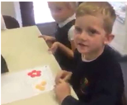
A year one using the part whole model to add

In Maths Year 1s and 2s have been learning about addition and subtraction and shape.