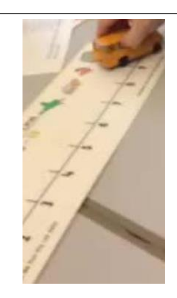
Numberlines and cars to solve subraction problems