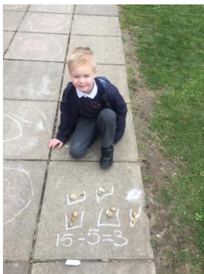
Using natural materials for division.