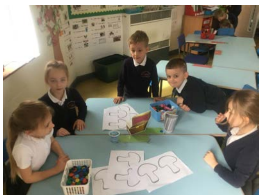
Using cubes, counters and diagrams for halving.