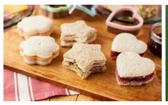
Cookie cutter sandwiches