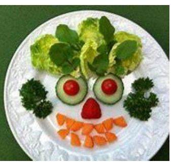
Fruit and veg faces